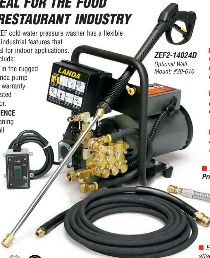
ZEF2-14024D Optional Wall Mount: #30-610

■ Helpful Tri-Lingual Labels with operating instructions in English, Spanish and French on the machine and on the wall near the on-off switch for added liability protection and operator convenience.