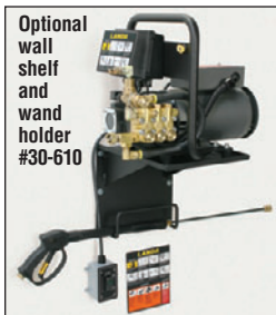
Optional wall shelf and wand holder #30-610

Landa's ZEF cold water pressure washer has a flexible design and industrial features that make it ideal for indoor applications. Features include: