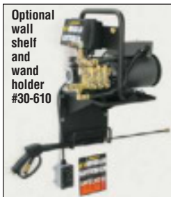
Optional wall shelf and wand holder #30-610

Landa's ZEF cold water pressure washer has a flexible design and industrial features that make it ideal for indoor applications. Features include: