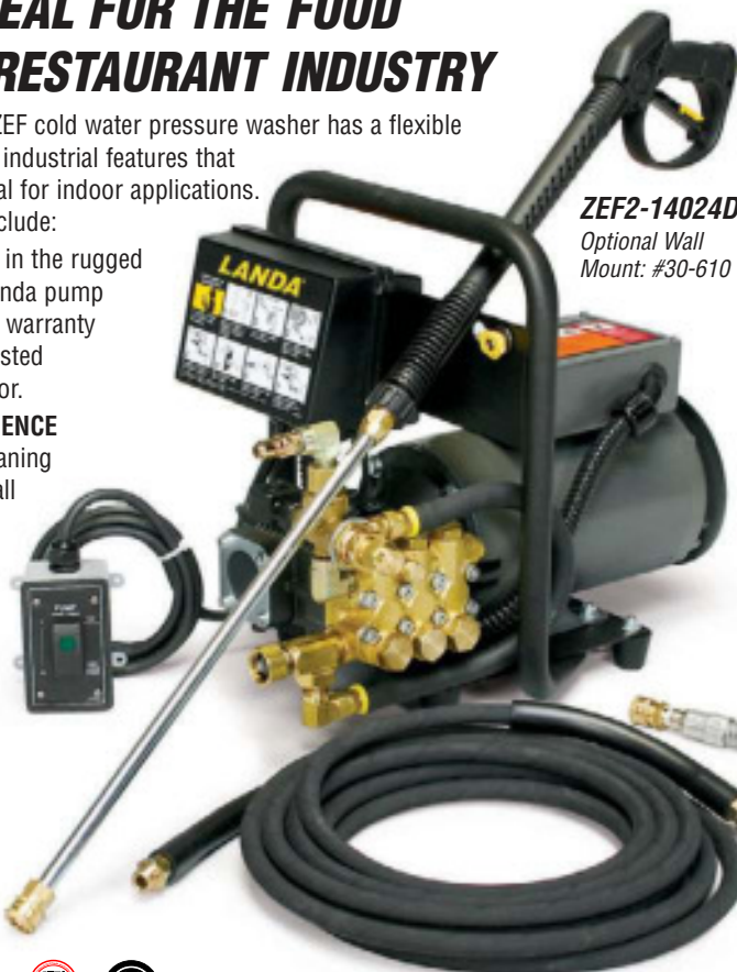
ZEF2-14024D Optional Wall Mount: #30-610