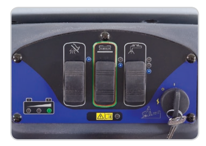
The ST 26 inch disc model – provides simple operation and robust scrubbing controls.

A self-adjusting splash skirt provides safety against splashing and reduces slip and fall accidents