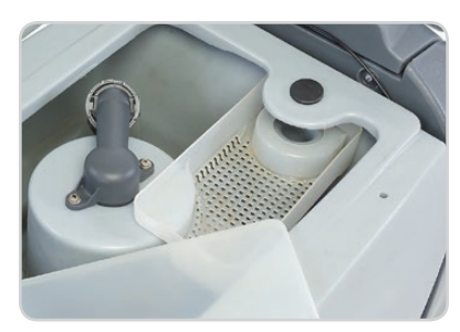
An integrated debris catch cage traps and collects drain clogging debris.