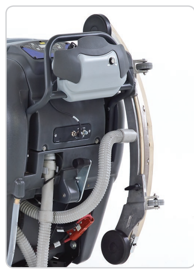
A built-in squeegee hanger makes transport easier and reduces trip and fall accidents.

A choice of an onboard charger or shelf charger provides convenient charging options