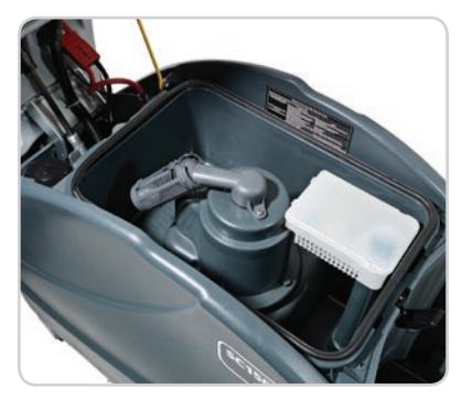
Flip-up lid and tilt-back tank provides easy access to the recovery tank, debris catch cage, batteries and EcoFlex<sup>™</sup> cartridge.