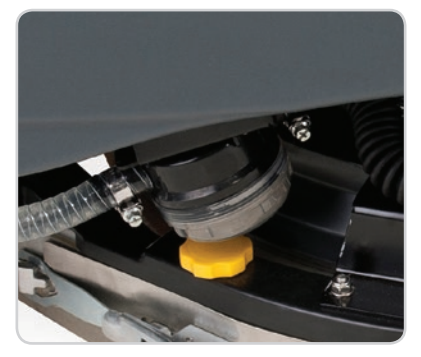
Externally mounted solution filter allows operators to easily clean the filter and manage the solution level.