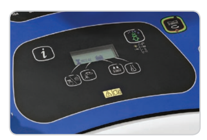
Simple, intuitive controls minimize operator training.

Rear polyurethane tires for outstanding traction - and high durability