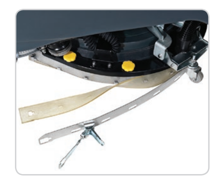
Squeegee wraps around the deck for 100% water pick-up and simply clips onto the bracket with no thumb nuts or adjustment required.