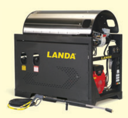
SLX: The industry's biggest and only portable hot water pressure washer that delivers 200°F water at a rate of up to 10 GPM, plus supports a 2-gun operation. The 3 models of the extra-rugged, skidmounted SLX are powered by gasoline or diesel and feature the Landa Pump with 7-year warranty.