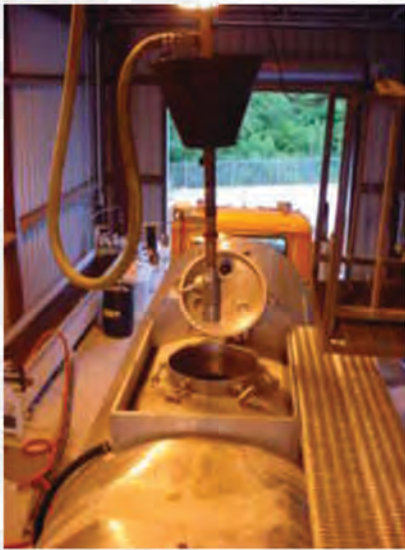
Pictured above is a Gamajet being lowered into position at a truck wash site.