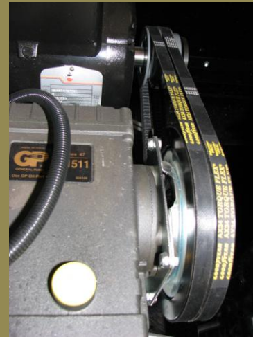
CLUTCH CONTROLLED PUMP