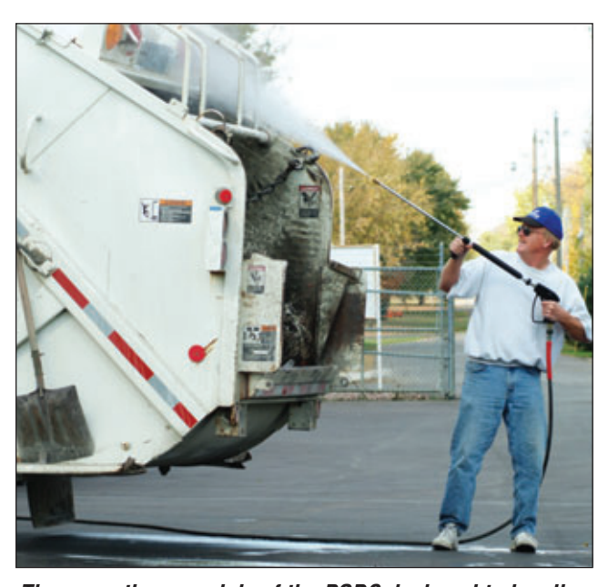
There are three models of the PGDC designed to handle the toughest of outdoor cleaning jobs.