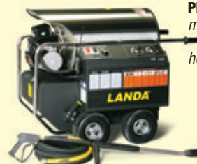
PHWS: Since 1980, Landa's most popular electric-powered, diesel-heated, portable, hot water pressure washer