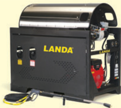
SLX: The industry's biggest and only portable hot water pressure washer that delivers 200°F water at a rate of up to 10 GPM, plus supports a 2-gun operation. The 3 models of the extra-rugged, skid-mounted SLX are powered by gasoline or diesel and feature the Landa Pump with 7-year warranty.