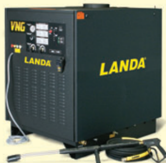
VNG: Our extensive line of natural gas- and LP-heated hot water pressure washers offer multi-gun operation with remote stations, ideal for wash rack cleaning.