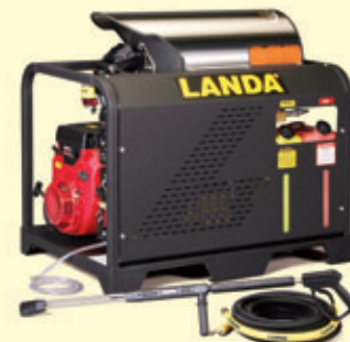
PGHW: Self-contained, gasoline-powered, hot water pressure washer with compact footprint